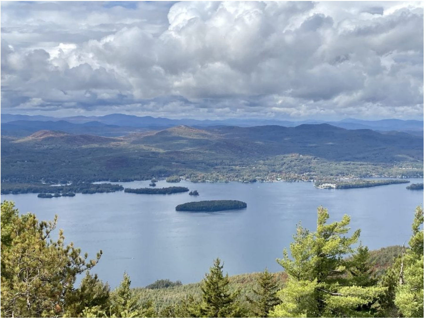
A view of Lake George from Buck Mountain looking across at Bolton Landing.